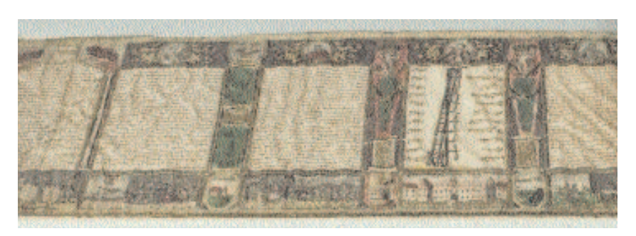
The Book of Ester is read at Purim. The most beautifully decorated books are often used for special rituals.

Covering the head In Judaism, covering one's head is a sign of respect for the divine. There are many possibilities, and the choice of hat or kippa often reveals a person's religious standpoint.